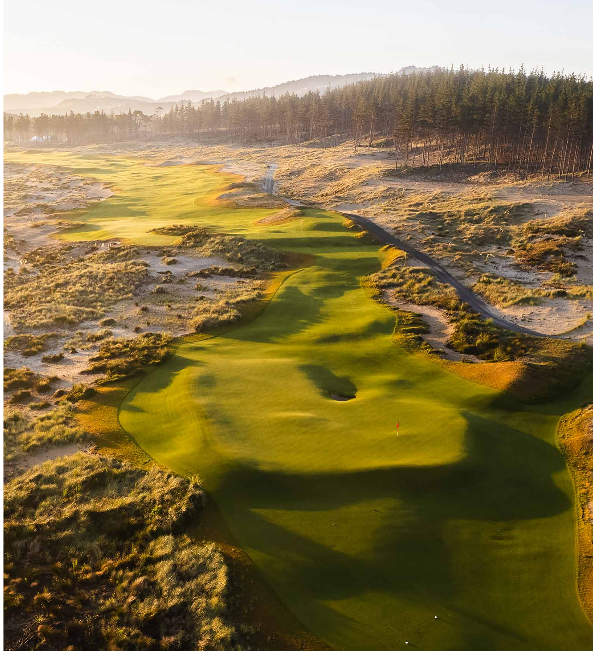
OPPOSITE: Te Arai Links: a 'special occasion' golf course, but one that's accessible to Kiwi golfers.

"The room rate currently sits at $800 per night in peak season but drops to as low as