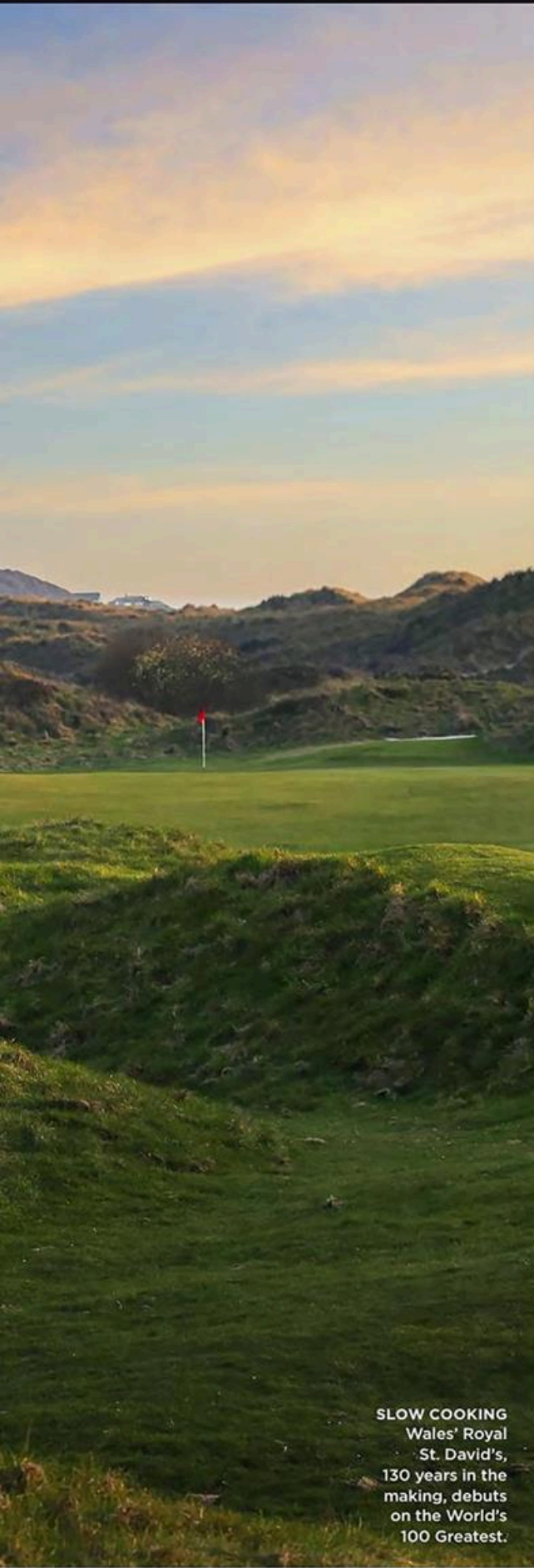
SLOW COOKING Wales' Royal St. David's, 130 years in the making, debuts on the World's 100 Greatest.